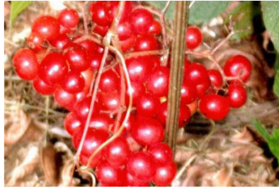
Ampelocissus carolinus (Carolina snailseed)

The Plant Book by D. J. Mabberley says there are 100 species of Ampelocissus in the tropics, some edible or used for medicine. Mine (from a Mennonite in Belize) is too acidic to eat.